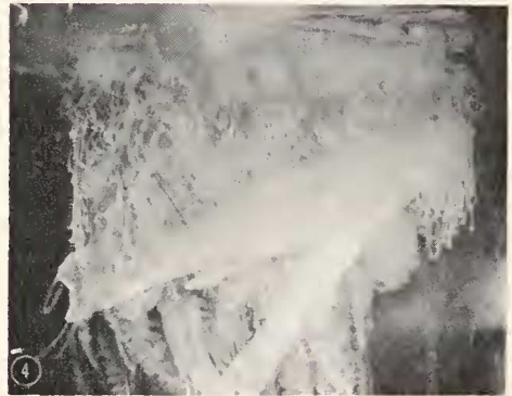
FIGURE 1. Physalia fishing tentacle captures small fish.